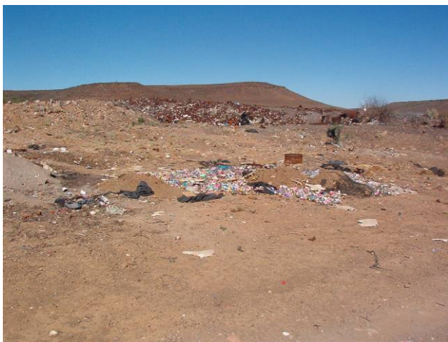
Vanwyksvlei disposal site