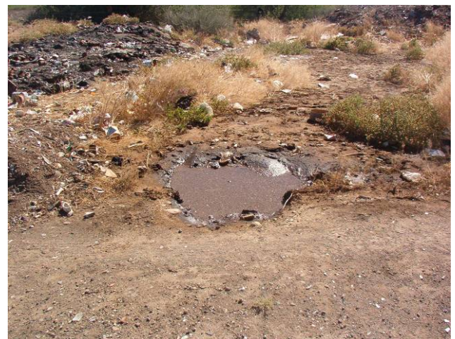
Sewerage disposed of on Vanwyksvlei disposal site