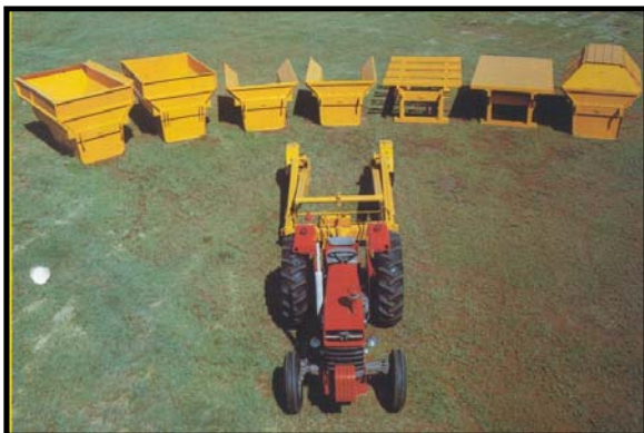
Tractor with utility trailer