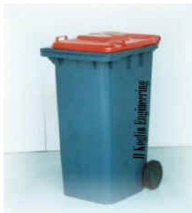
240 litre wheelie bin