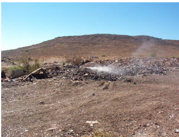
Burning of the Waste Body