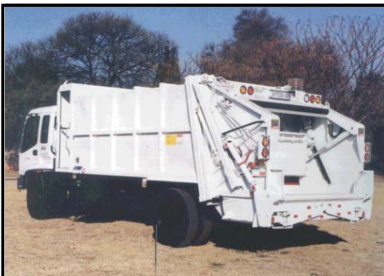
12 m 3 REL

The following pictures represent some of the equipment mentioned above.