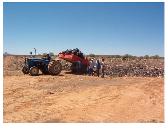
Waste tipped at Vosburg disposal site

The Vanwyksvlei Landfill Site is located approximately 3 km outside town. The site is not properly fenced and access is not controlled. No operational plan exists for the management of the Vanwyksvlei disposal site. Wind-blown litter is also a serious problem in the vicinity of the site. There is no landfill equipment on the site and therefore covering of the waste does not occur at all. Waste is burned after disposal.