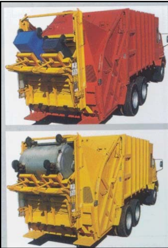
19 m 3 REL: Lifting 240 litre wheel bin