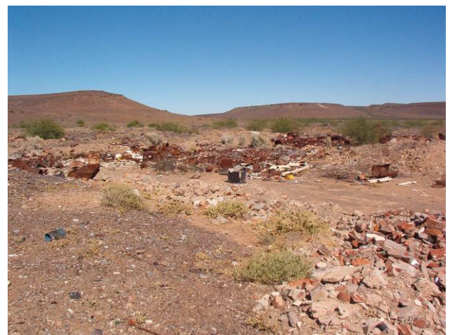
Waste spread over large area at Vanwyksvlei disposal site