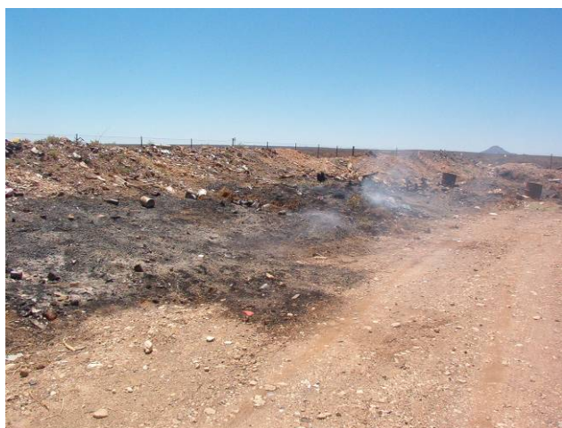
Waste is burned at the Vosburg site